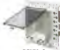
DBVM2C Two-gang for Stucco

IN BOX meets 2017 NEC, Section 406.9 (B) for the protection of exterior outlets which require the use of an extra-duty weatherproof while-in-use cover for all outdoor 15 or 20 AMP receptacles. Also meets 2015 CEC (Rule 26-702) for receptacles exposed to the weather.