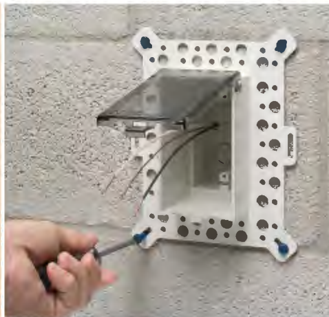
for Textured Surfaces, Rigid Siding