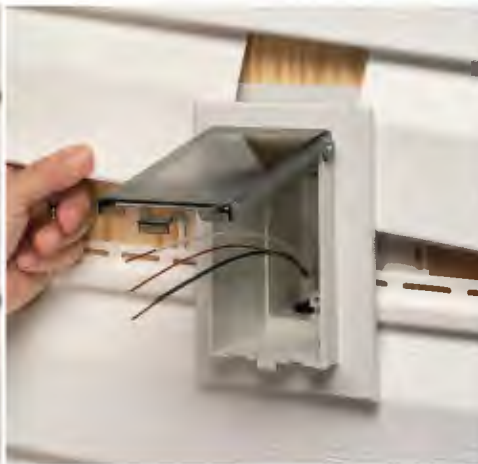
for New & Existing Vinyl Siding