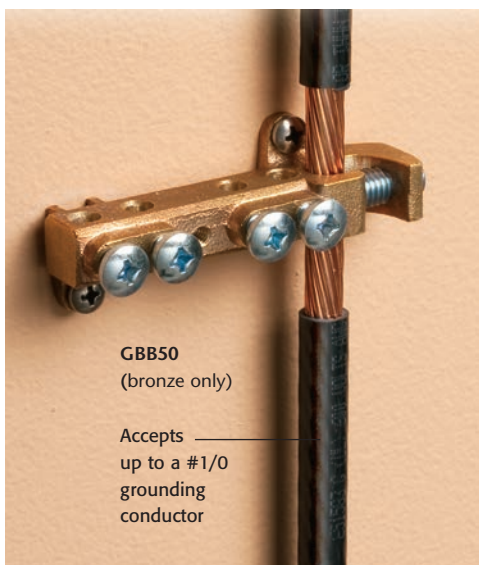
GBB50 (bronze only)

Accepts up to a #1/0 grounding conductor