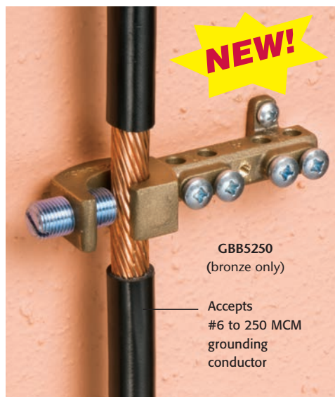
GBB5250 (bronze only)

Accepts up to a #1/0 grounding conductor