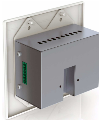
unDX4I Rear (2 outputs shown)