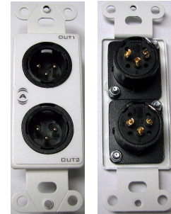
unAX20 (optional passive output plate)